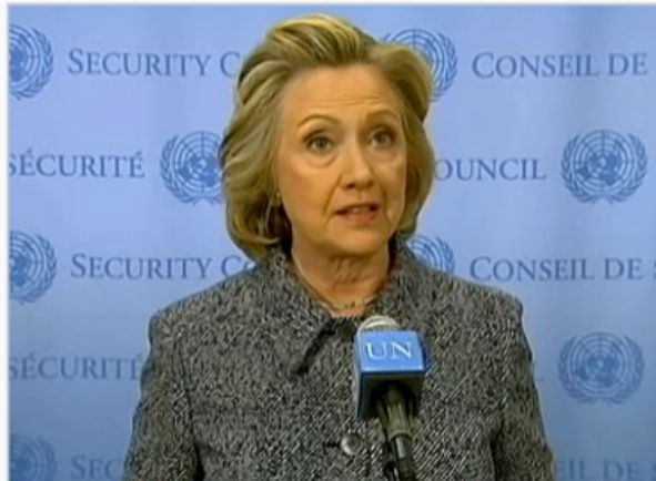
Clinton addressing email controversy with the media at the UN Headquarters on March 10, 2015.

http://www.foxnews.com/politics/2016/01/19/inspector-general-clinton-emails-had-intel-from-most-secretive-classified-programs.html