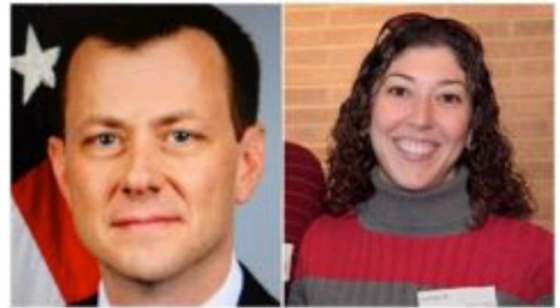
FBI agent Peter Strzok and his mistress, FBI lawyer Lisa Page.

https://www.cnsnews.com/news/article/michael-w-chapman/judicial-watch-doj-mueller-wanted-hide-truth-how-strzoks-biases-have